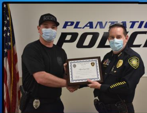
AUGUST OFFICER DUTY