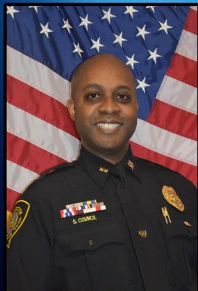
SEYMOUR COUNCIL PATROL