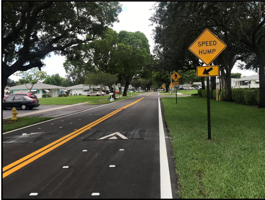
Traffic Management – Lauderdale West Drive