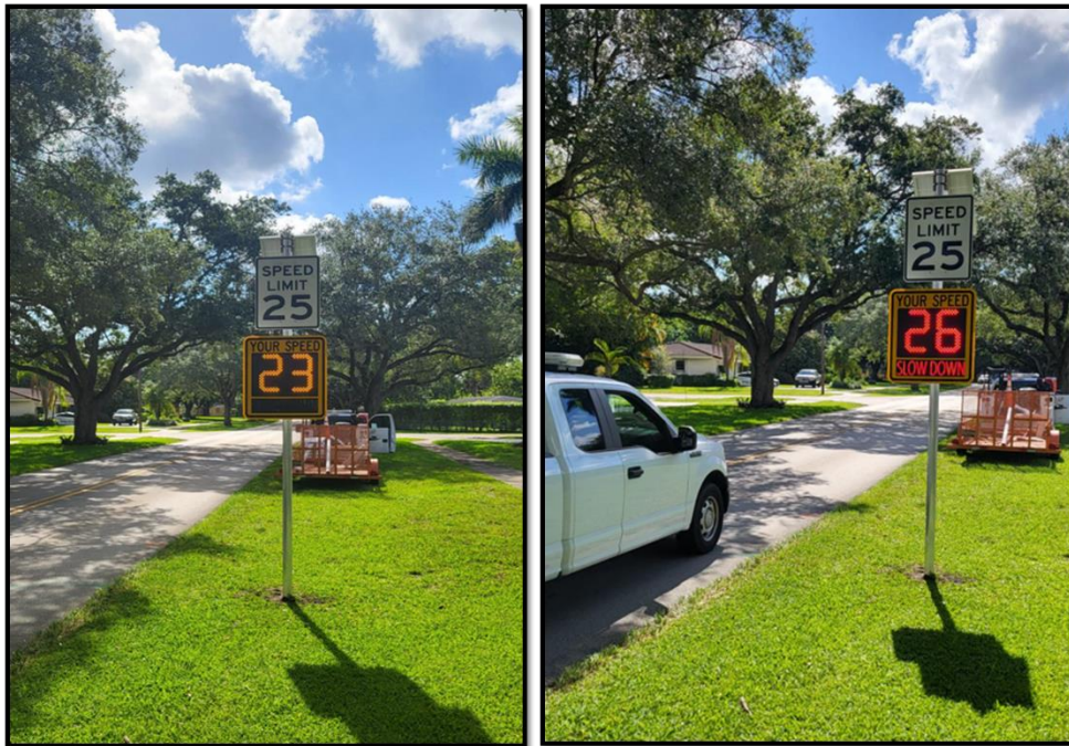
Traffic Management – Plantation Road

The Engineering Department, in collaboration with Public Works have worked to implement traffic calming measures at multiple locations. Below are few projects that were recently completed.